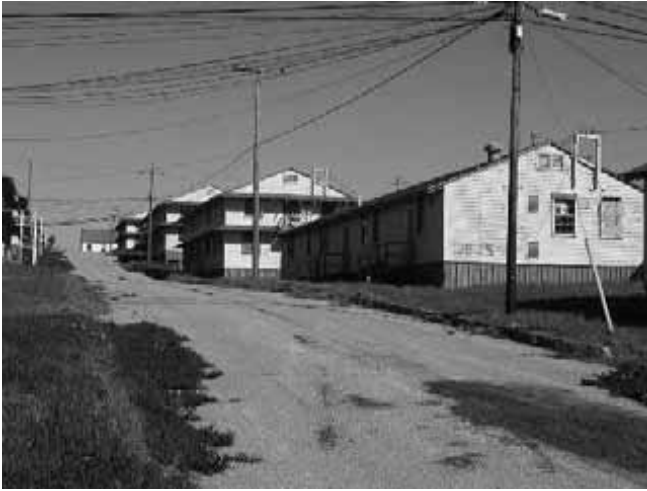
Figure 1. — Single-story barrack in Fort Ord from which LBP siding was obtained.

from deconstructed buildings. Worker and workplace exposure to lead during wood remilling operations is evaluated in a companion paper (Falk et al. 2005).