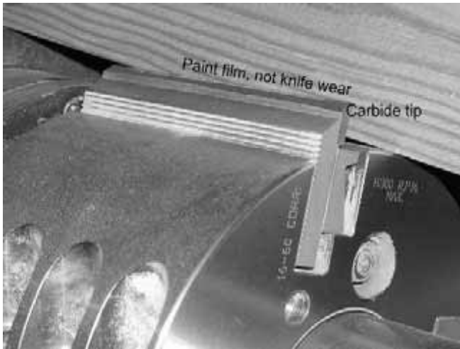
Figure 6. — Condition of carbide-bonded knife after processing more than 3,000 lf of knotty southern pine LBP siding material.

the basis to derive a dollar value estimate. FOB prices for clear mixed grain or sorted vertical grain boards were reported at $1,675 and $1,050 per thousand board feet (MBF), respectively (Crows Market Report 2003). Several western manufacturers contacted indicated an up-charge of $100 to $200 per MBF for their valued-added millwork production. Accordingly, $1.20 to $1.90 per board foot was estimated as a