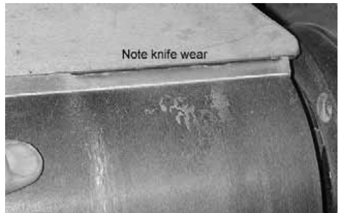
Figure 5. — Condition of conventional high-speed steel knife blade after processing approximately 900 lf of Douglas-fir LBP siding material.

While the focus of this project was to determine the technical feasibility of producing a value-added wood product from