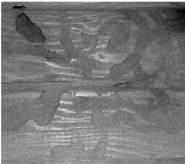
Figure 4. — Insect damage exposed after siding was remilled.

coloration when used for exterior applications, an experiment was conducted on the remanufactured Douglas-fir bevel siding millwork to determine if bleed-through would be a problem in the reuse of this material. Despite exposure to the rather rigorous cyclic high/low humidity with elevated temperature specified in ASTM D 3459, none of the specimens showed metallic discoloration. Discoloration from iron stain did not occur even after an additional two cycles. However, most specimens yellowed as a result of extractive bleeding after only four to five cycles. We therefore conclude that extractive bleeding would be a problem long before iron bleed-through in the remanufactured siding.