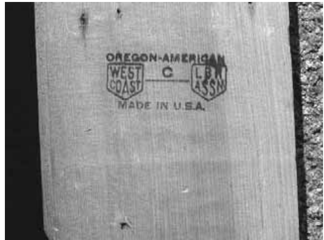
Figure 2. — Grade stamp marking observed on several pieces of salvaged Fort Ord siding.

To evaluate the effects of potential iron discoloration on the remanufactured bevel siding, specimens were cut from the processed siding and subjected to exposure testing. Nail holes were qualitatively ranked as having a low, medium, or high